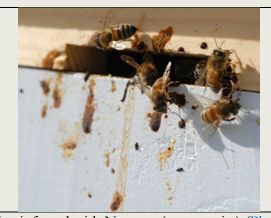
Hive infected with Nosema (gut parasite) (Photo) <u>USDA information on Nosema</u>