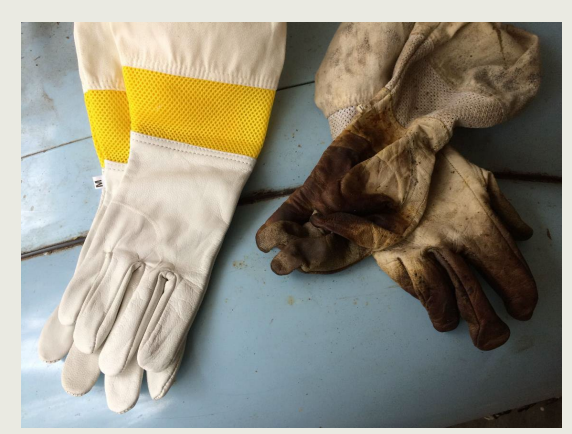
Caring for your protective equipment is important for your safety and the health of your apiary Photo credit